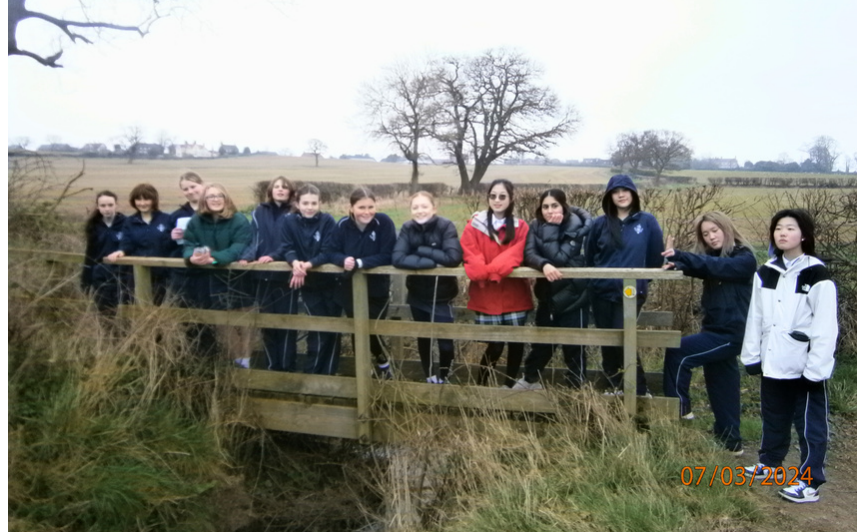
Year 10 Wayfarers Class enjoy a walk in the local area, developing their map reading skills ready for DofE.

137 divided by 43 = 3.186 . So with our human circle, we got close, we estimated pi correct to the nearest whole number and (if truncated) to one decimal place!