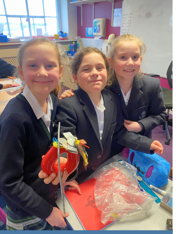
Year 3 and 4 investigating materials using magnets. The girls were sorting materials on whether they were magnetic and non-magnetic. They were also looking at how magnets attract and repel each other. They also had a marble race track - how fast can they get the magnetic marble to the end with the magnet?