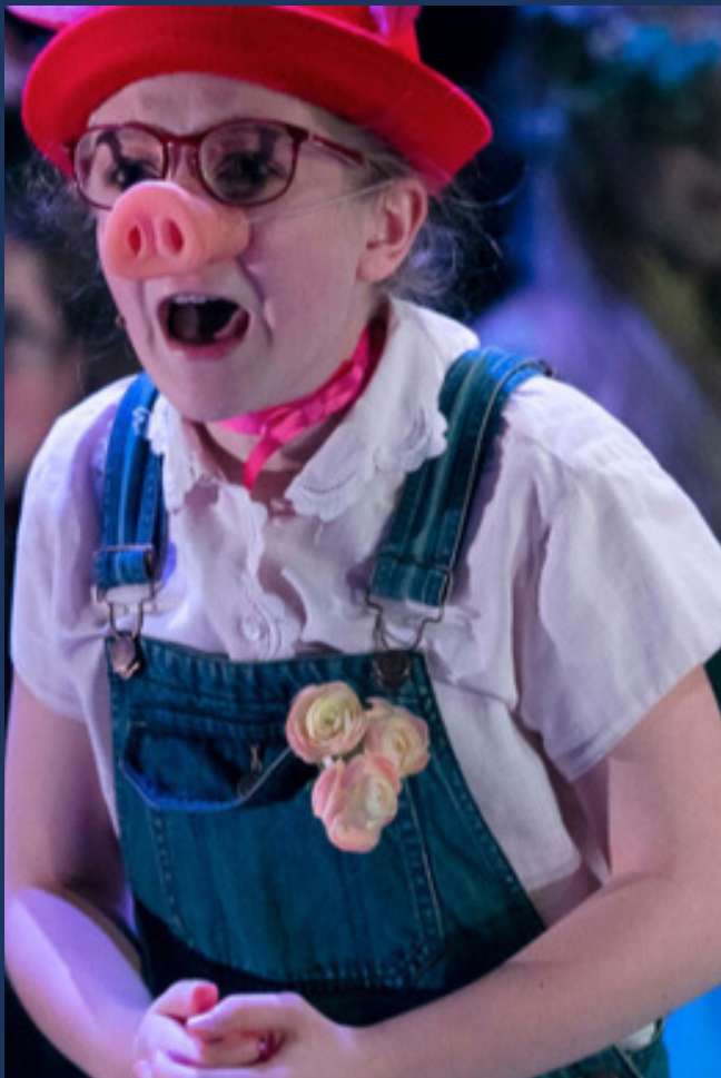
Hattie National ISA Musical Theatre Award