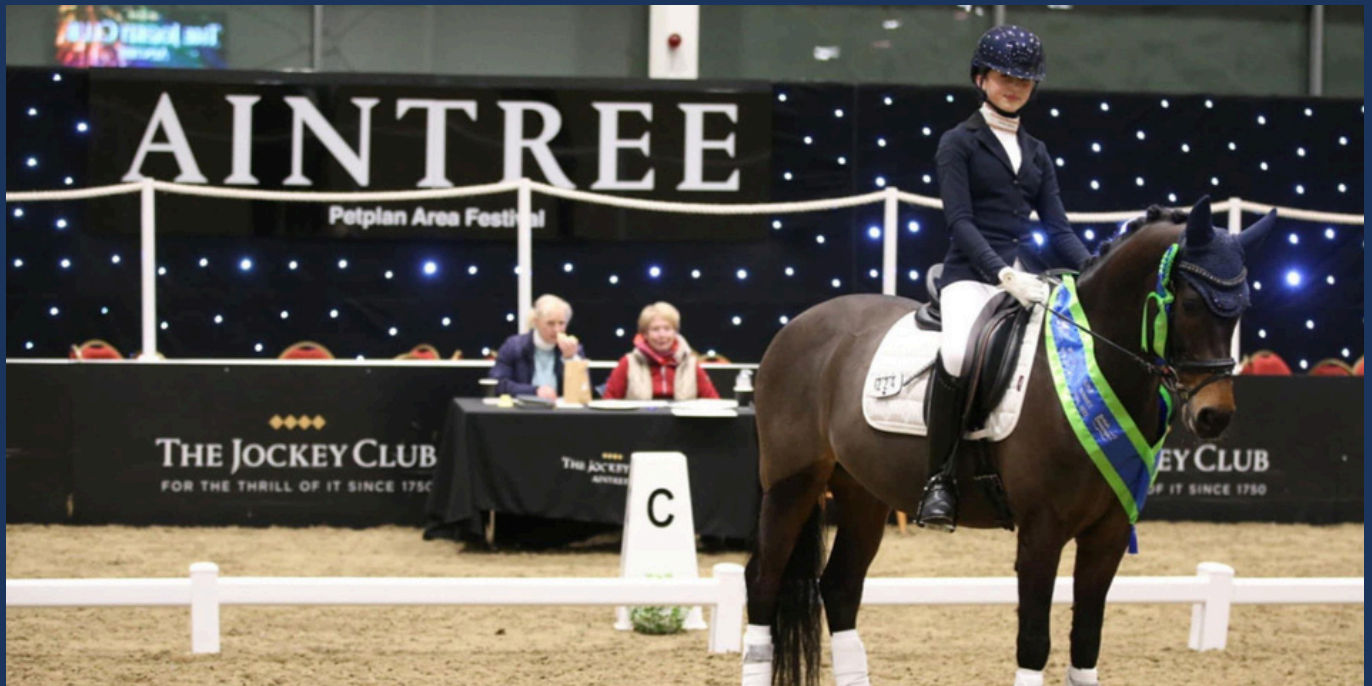
Fleur British Dressage Championship